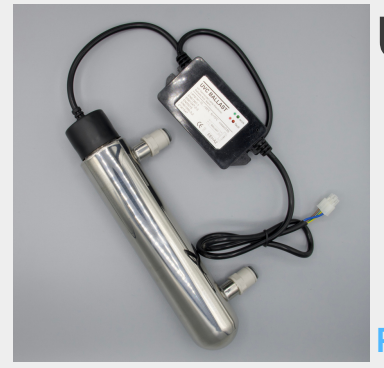
UV Filter Kit