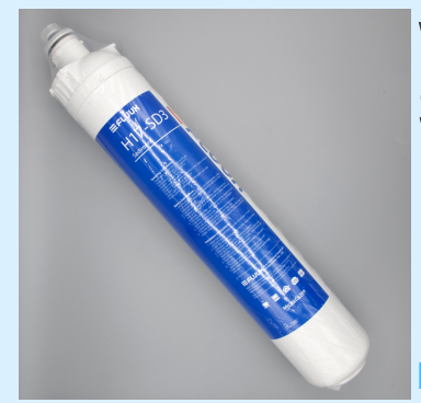
Water Filter Sediment