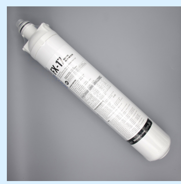
Water Filter Microplastics