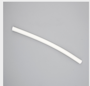
Tubing – 8mm x 2mm