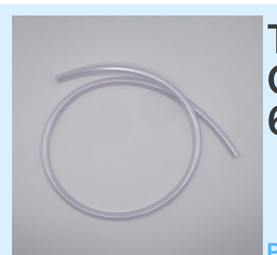
Tubing -Clear PVC -6mm x 9mm