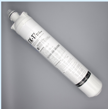
Water Filter Microplastics