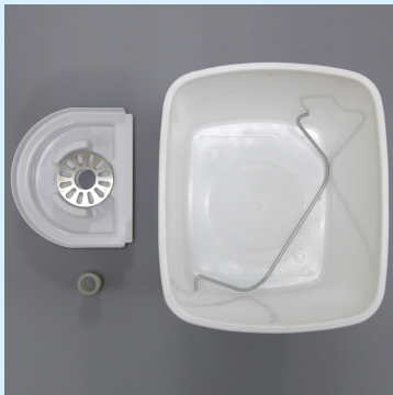
H2O Hygiene Kit