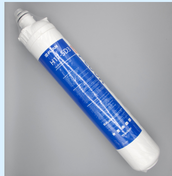
Water Filter Sediment