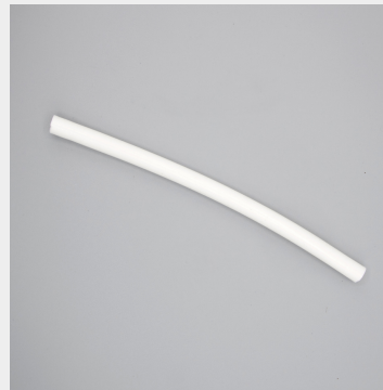
Tubing - 8mm x 2mm