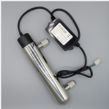
UV Filter Kit